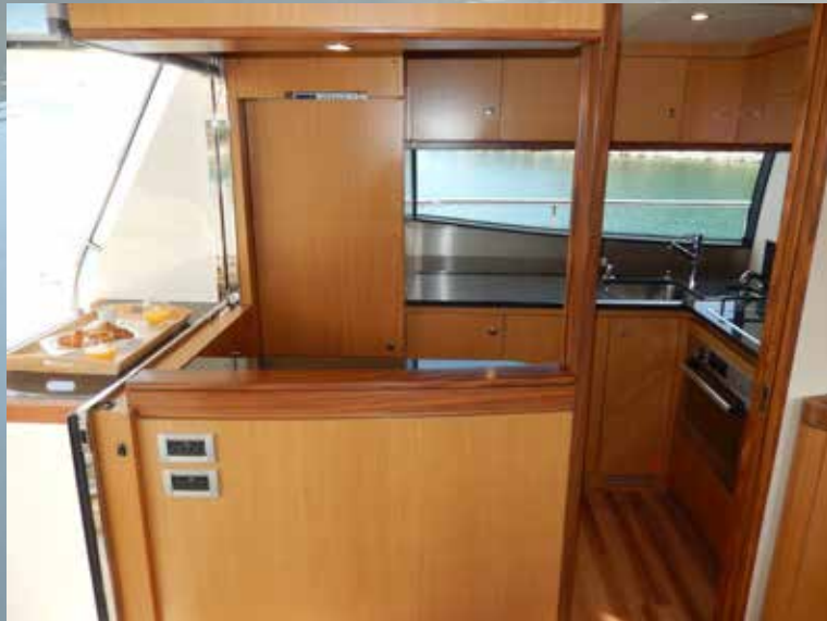
KITCHEN & DINING TABLE